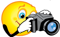
Photo retake day will be held on Tuesday November 26 th , 2019 . Students are reminded to dress in school uniform.